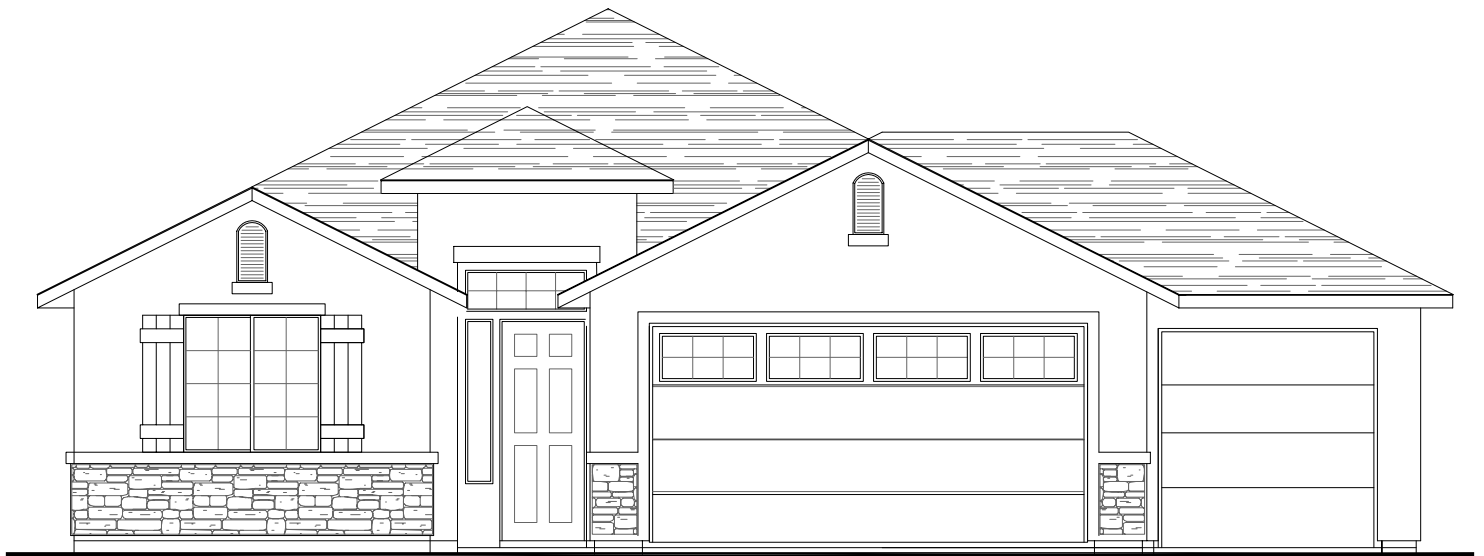
QUARTZ II ELEVATION B